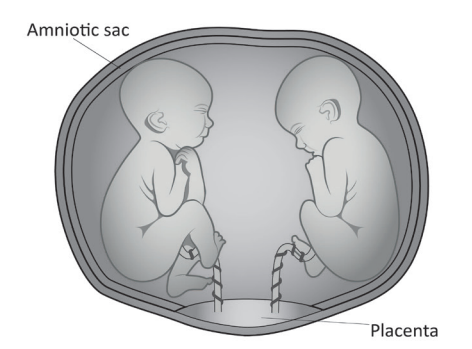
Monochorionic monoamniotic (MCMA)

Similarly, triplets can be trichorionic (each baby has a separate placenta), dichorionic (two of the three babies share a placenta and the third baby has its own placenta), or monochorionic (all three babies share a placenta).